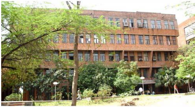
School of Social Sciences