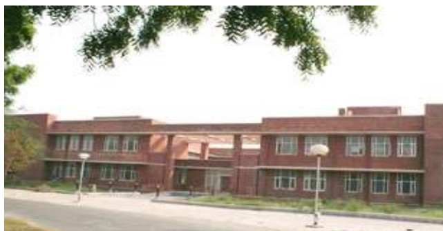
SCHOOL OF PHYSICAL SCIENCES

The School of Physical Sciences (SPS), is one of the leading departments in India in terms of research and teaching in Physical Sciences. Some years ago, the school has started Ph.D. programmes in Chemical and Mathematical Sciences as well. Over the years, the SPS faculty has made significant contributions to novel interdisciplinary areas interfacing Physics, Chemistry and Mathematics, in addition to the more traditional areas of Physics. The school has state of the art computing facilities and well-equipped laboratories for Physics and Chemistry and a rich library with an excellent collection of books on Mathematics, Physics and Chemistry.