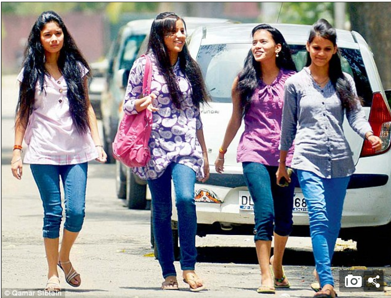
Current rules at Delhi University are not sufficient to protect students as well as staff from sexual harassment (picture for representation only)

In the entire episode, Arora had maintained that he had done nothing wrong.